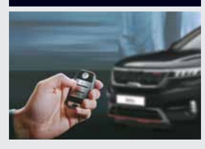
Sets new trends in innovation by offering convenience of remote start with manual shift and hand parking brake