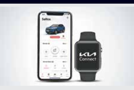
Elevates your connected car experience in an inspiring way with 58 smart features