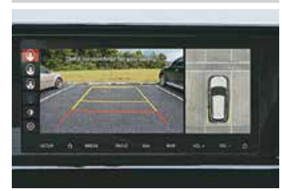
Keeps you aware of surroundings at all times