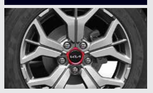
Come as standard and enhance your braking performance, so you are always in control of any unforeseen event