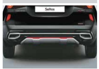
Adds to the tough looks and provides a strong road presence