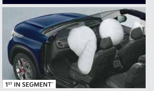
Gives you an added sense of superior safety with 4 airbags as standard and an option of 6 airbags in select variants