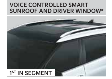
Now operate the smart sunroof and driver side window with ease

Fights against virus and bacteria while monitoring AQI status