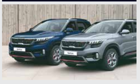
Allow you to announce your arrival as the colors compliment your badass personality