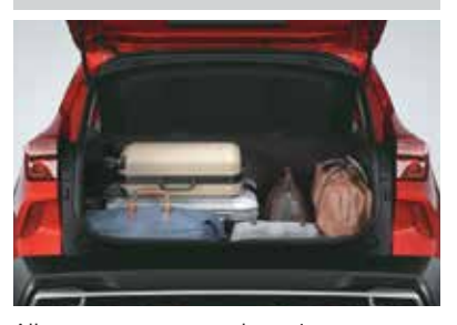
Allows easy access and spacious enough to accommodate luggage for a weekend trip