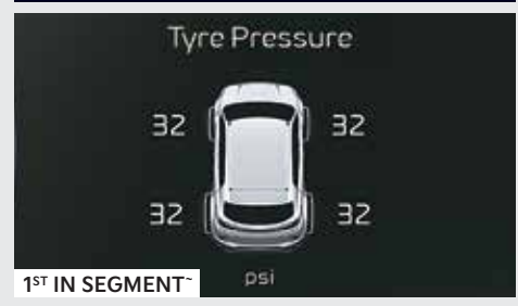
Offers standard real-time update about tyre pressure so you can hit the road without any worry