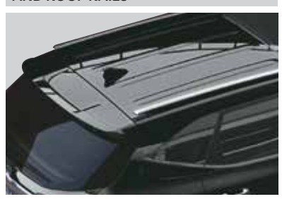
Give a sporty and dynamic appeal to the badass design