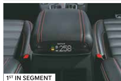
Lets you and your loved ones breathe the cleanest air inside the car