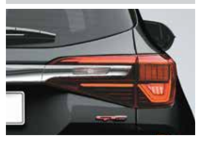
Complement the muscular back to give it a Enhance its overall sporty appeal premium appearance