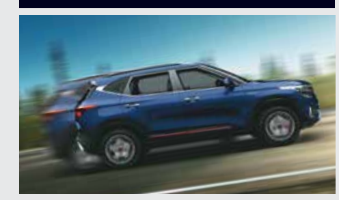
Comes as a part of standard safety package making your journey safer & reliable