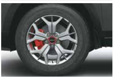
Are absolute showstoppers. One glance, and you'll know why